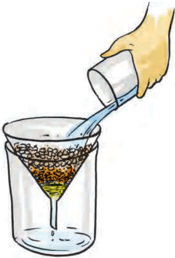
Fig. 13.2 Filtration process