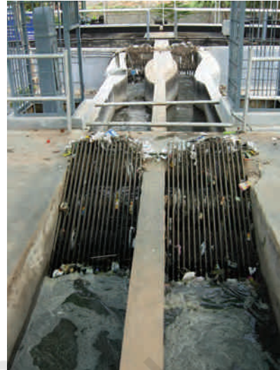
Fig. 13.3 Bar screen