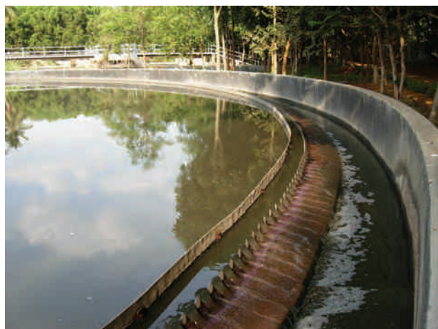
Fig. 13.5 Water clarifier

a scraper. This is the sludge . A skimmer removes the floatable solids like oil and grease. Water so cleared is called clarified water (Fig. 13.5).