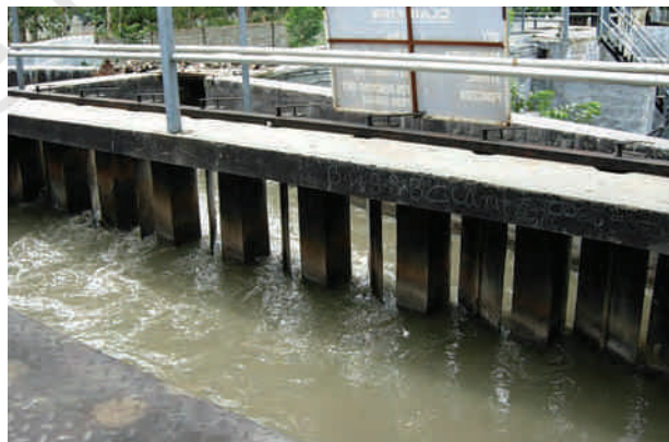
Fig. 13.4 Grit and sand removal tank