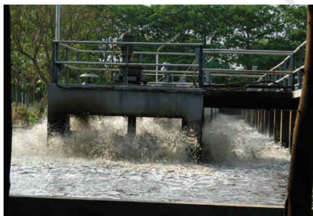
Fig. 13.6 Aerator

After several hours, the suspended microbes settle at the bottom of the tank as activated sludge. The water is then removed from the top.