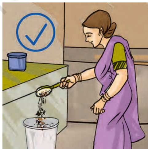
Fig. 13.7 Do not throw everything in the sink